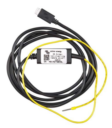
VE.Direct non inverting remote on-off cable

Switch off level: input voltage must be less than 1 V or must be free floating